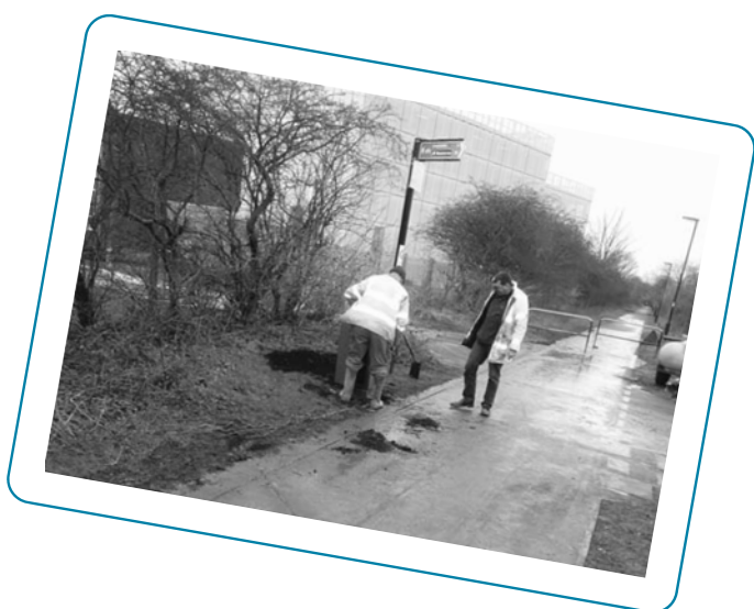
Cycling loop counters being installed on Coxlodge waggonway.

The cycling budget comes from the Tyne and Wear Local Transport Plan. Improvements for cyclists will also be funded as part of other schemes through general traffic management plans, and through developer contributions. In addition to LTP funding, a number of other sources of funding, both internal and external can often be identified to contribute towards both capital and revenue schemes.