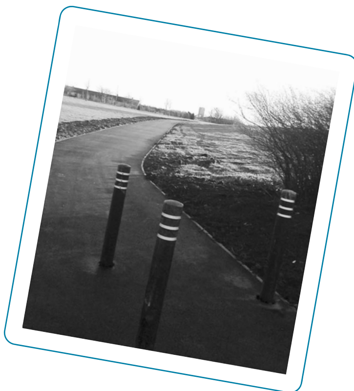
A new cycle link to Kenton School

We promote the attractiveness of walking and cycling to schools as part of the national Sustainable Modes of Travel Strategy (SMOTS). Newcastle City Council actively supports and encourages programmes such as Sustrans Safe Routes to School and Bike It.