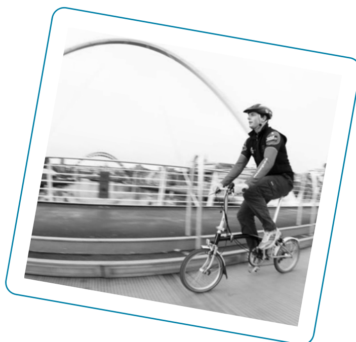
Working with partner BikeRight on adult cycle training