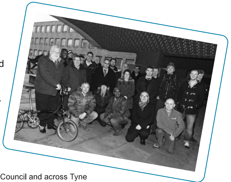
Officers from Newcastle City Council and across Tyne and Wear come together with members of the Newcastle Cycling Forum for a cycle infrastructure design workshop.

The policies in this document have been developed in conjunction with the Newcastle Cycling Forum, which is supported by the City Council, and includes representatives of the transport charity Sustrans, national and local cycling organisations (CTC, Newcastle Cycling Campaign), Bicycle User Groups and members of the public.